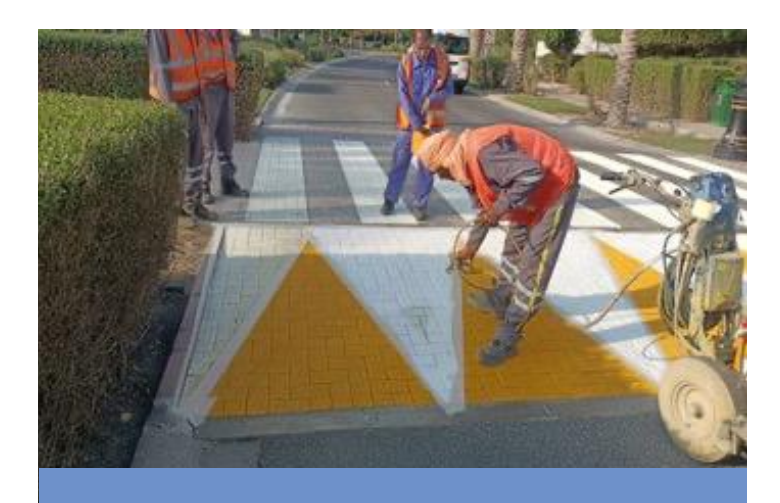
Pedestrian crossings needed a paint refresher.