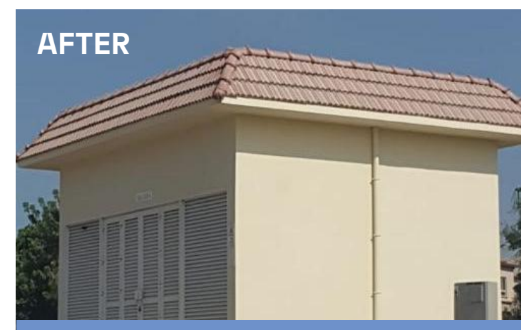
All 38 substations are currently under repair with plaster repair works and a fresh coat of paint being applied.