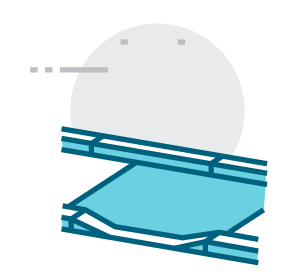
Epoxy painting of footpath around Cluster 22 park