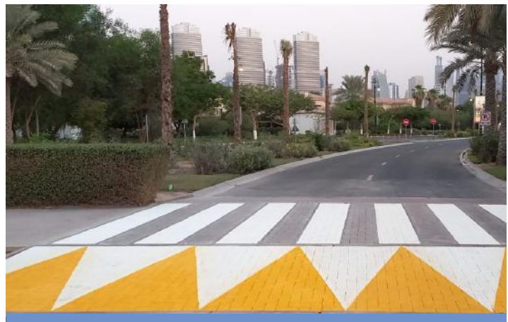
In time for increased outdoor activity by residents, all 6 pedestrian crossings have been repainted around the community.