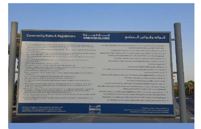
18 new Community Rules & Regulations signages have been replaced around Jumeirah Islands.