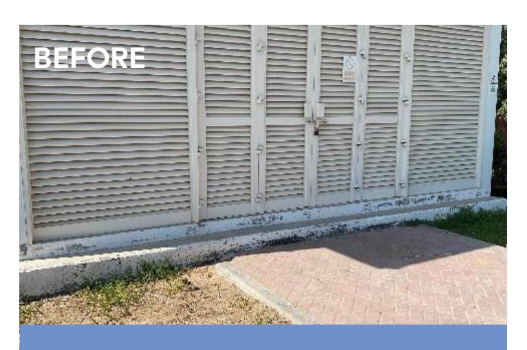
Jumeirah Islands has 38 substations that needed a face lift.