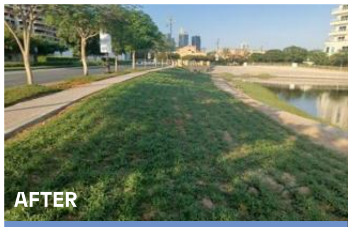
The drive and walk to Jumeirah Islands is being enhanced with landscaping works, such as this stretch adjacent to Jumeirah Heights East.