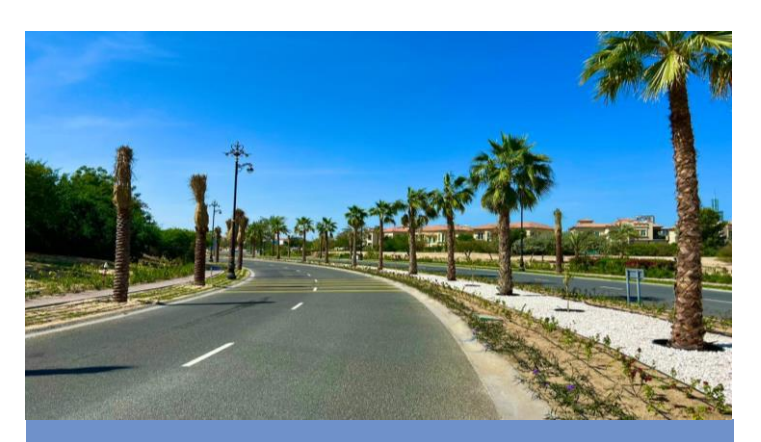
Landscaping enhancements have been completed along the main driveway.