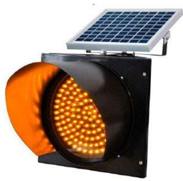
In our efforts to control speeding vehicles in the community, new speed hump warning lights powered by solar energy will be installed.