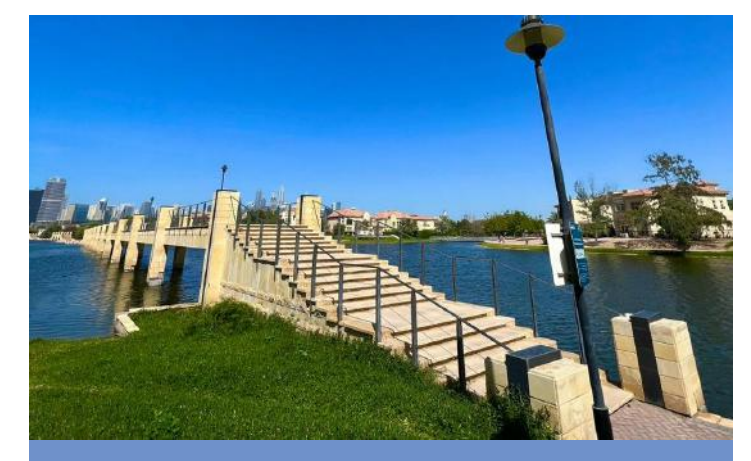
We have planned the installation of cove lights under the concrete bridges as we enter the hotter months.