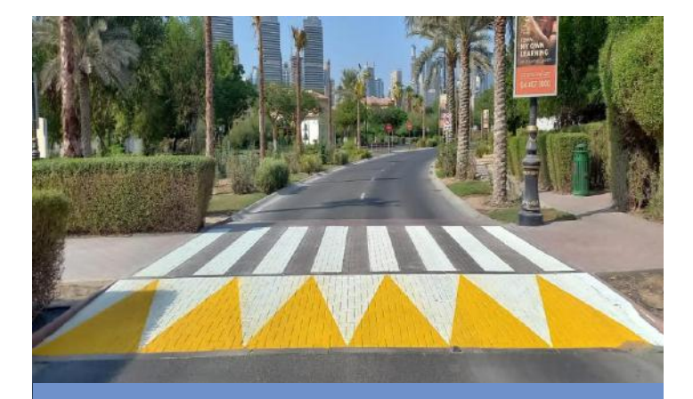
Good news for pedestrians. Additional pedestrian crossings on the main road are coming soon.