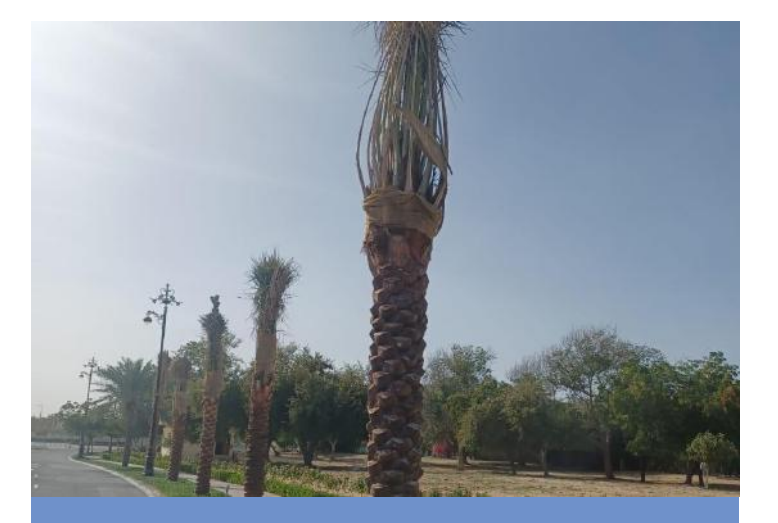
319 new and beautiful palms were planted along the right-of-way area in the community.

The green shaded areas depict locations where landscape improvements were carried out and completed.