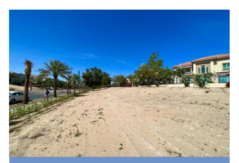
Landscaping enhancement of sandy areas between the clusters is planned for March-end. The design of the area in front of Cluster 26 is the inspiration for the rest of the sandy areas in the community.