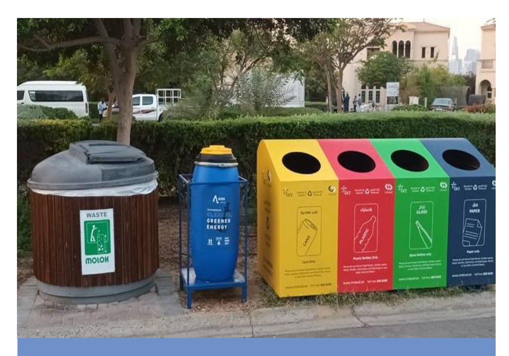
Each cluster has a collection point with a barrel set up for the safe disposal of used cooking oil.

We have appointed our service provider, Averda to collect used cooking oil from the community, at absolutely no cost. In just a few simple, mess-free steps, residents can transform their used cooking oil into bio-diesel. For every litre of oil collected, Jumeirah Islands will receive a nominal revenue, which will be re-invested into a sustainable project within the community.