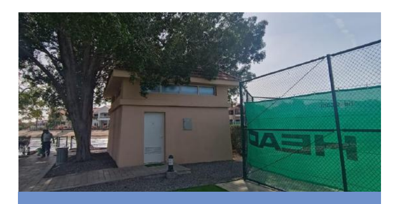
The washrooms at the Cluster 22 park is set for a complete refurbishment planned over four weeks. Works will commence shortly and notifications on closure of the amenities will be shared in advance.