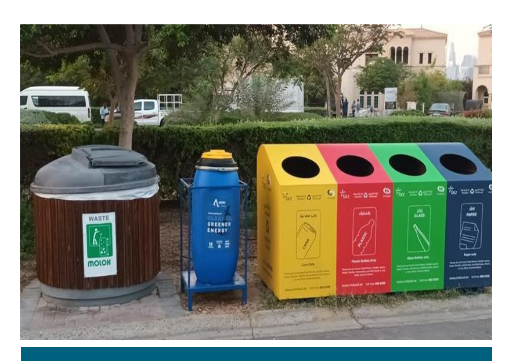
Each cluster has a collection point with a barrel set up for the safe disposal of used cooking oil

Used cooking oil collection kits have been distributed to each home. The kit contains a bottle, funnel and filter, to easily collect oil in the kitchen.