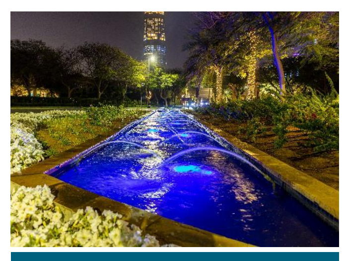
Installed underwater lights in five water features

Installed new festoon lights on the gazebo by the fruit garden near Clusters 19 and 20