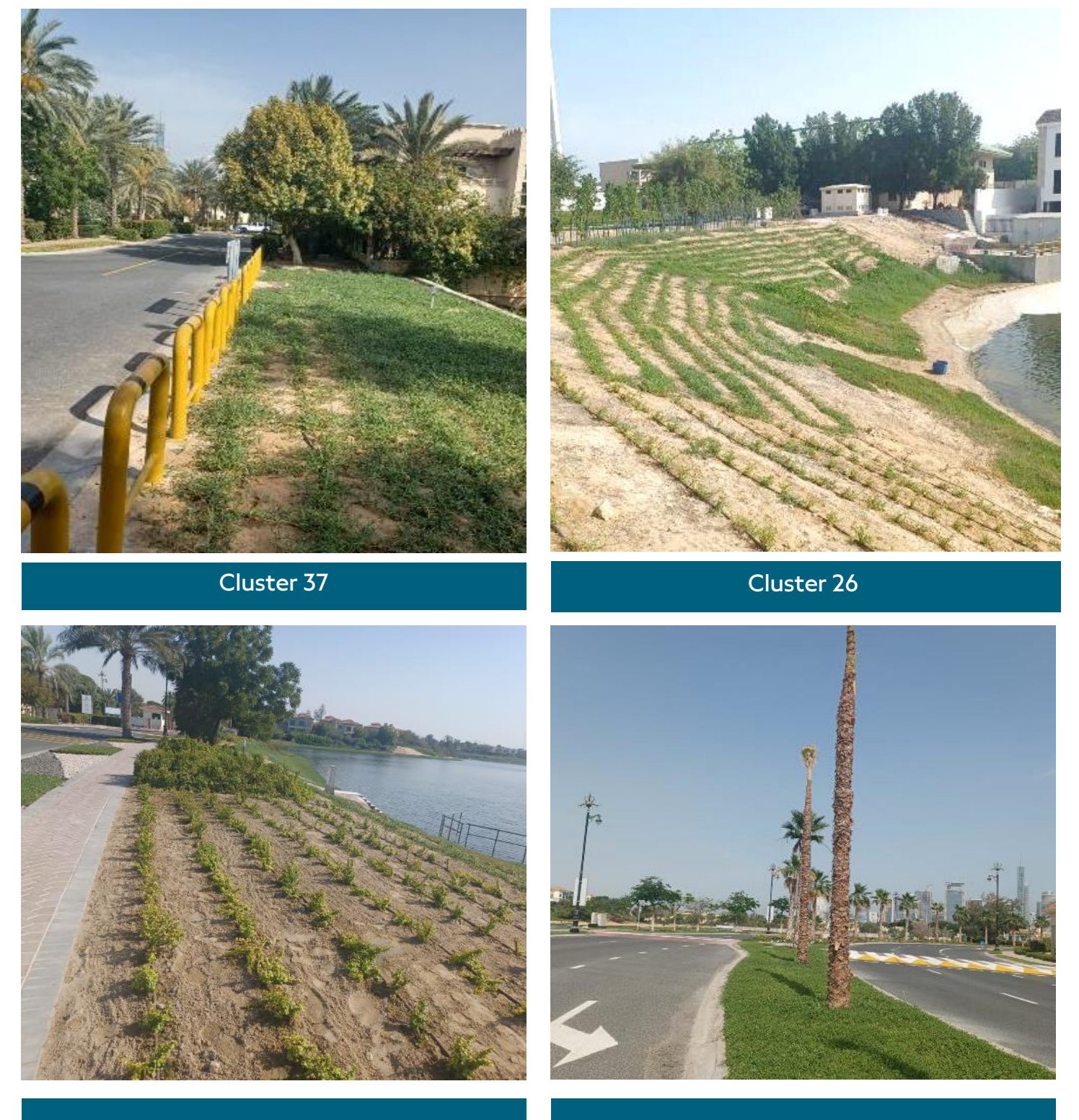
Around Gate number 2