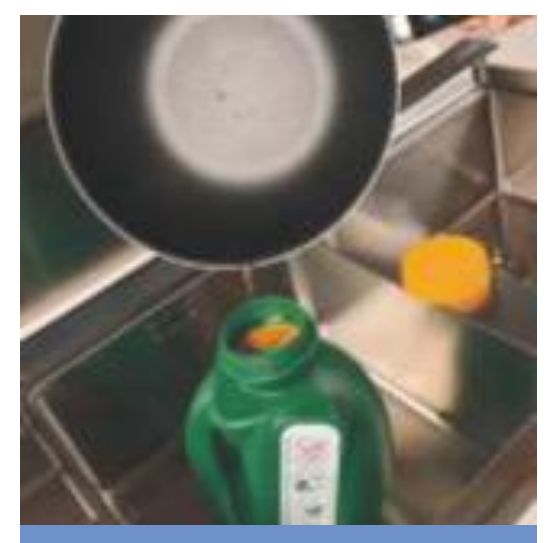
Household-sized collection containers will be distributed to each villa in January 2023

Once the project is set to launch later this month, we will be sharing an informative video on how to safely collect, store and sustainably dispose of your used cooking oil.