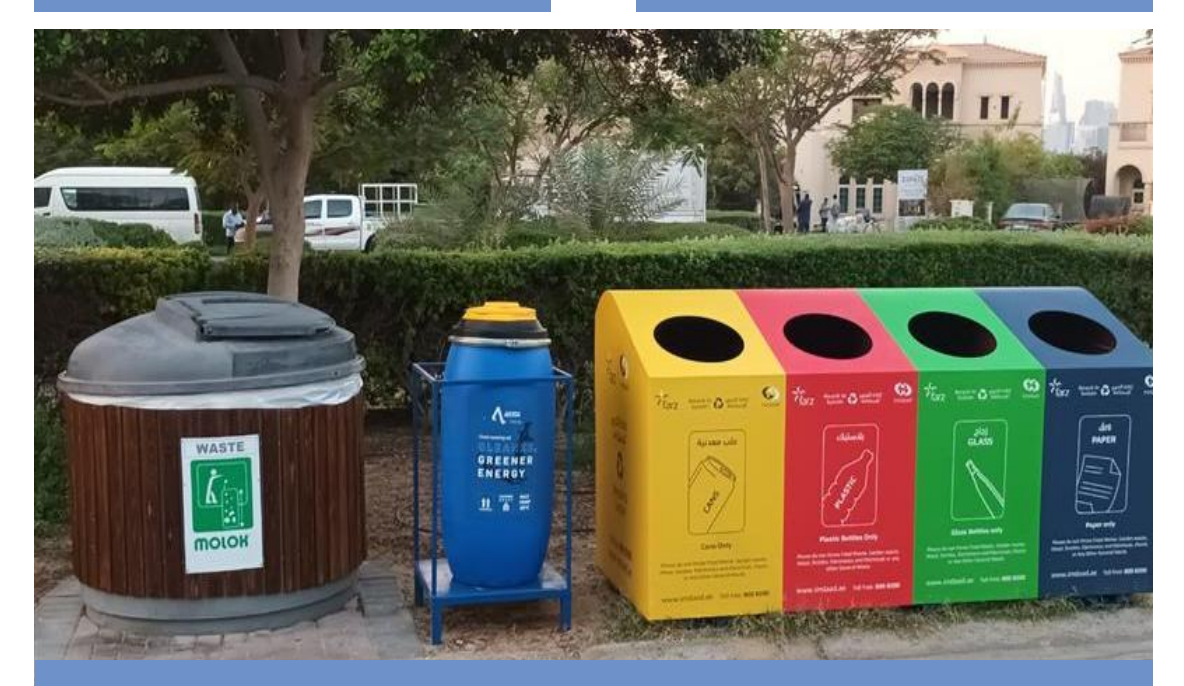
Multiple collection points will be set up across Jumeirah Islands for convenient and safe disposal of used cooking oil.