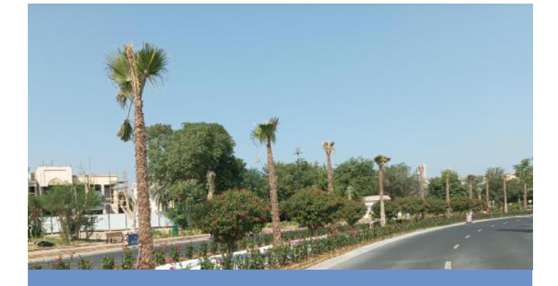
Gate 1 centre median landscaping works have been completed.