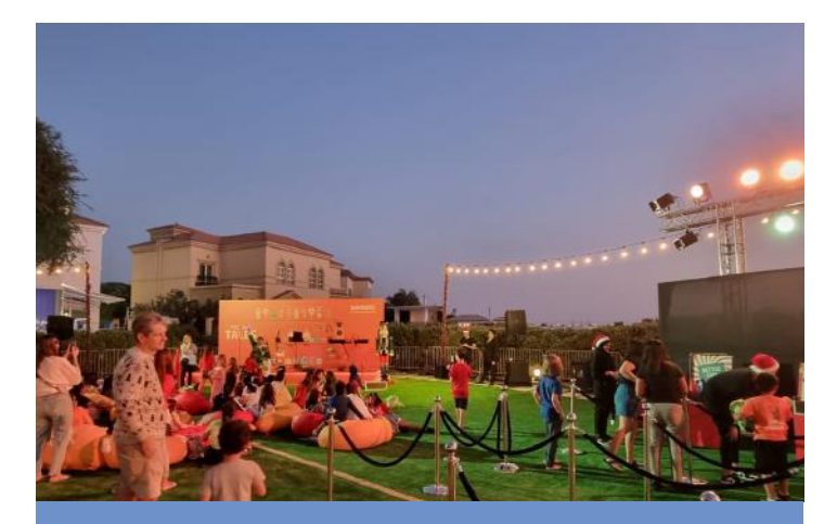
The event was held at the Cluster 22 park and ran from 4pm to 9pm.