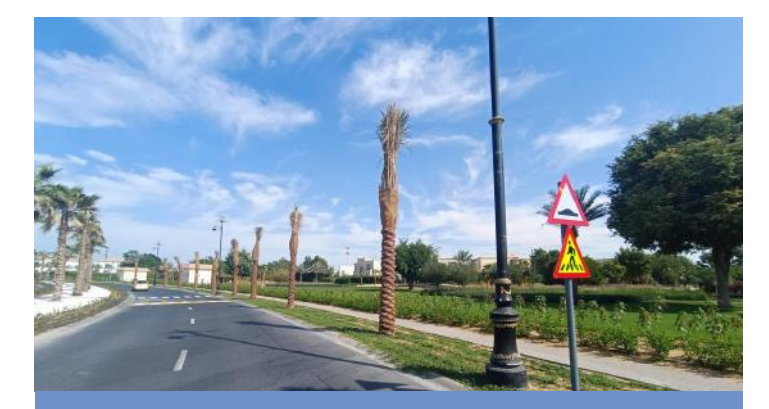
162 palms have been planted along the right-of-way, starting at Gate 3, to replace unviable and removed palms. Another 238 palms are to be planted in the coming weeks.

By the end of December, 80% of earth works and 60% of plantation works related to the centre median and right-of-way landscaping works have been completed. The remainder of the works are to be completed by the end of January 2023.